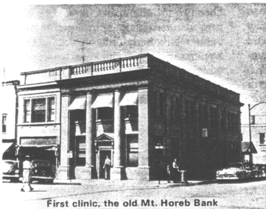
First clinic, the old Mt. Horeb Bank