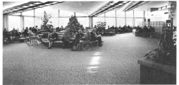
Gonstead Clinic Reception Room

The Gonstead Seminar has increased its teaching staff and enlarged the curriculum. Proposed expansion of Clinic facilities in 1973 will make it possible for additional classes.